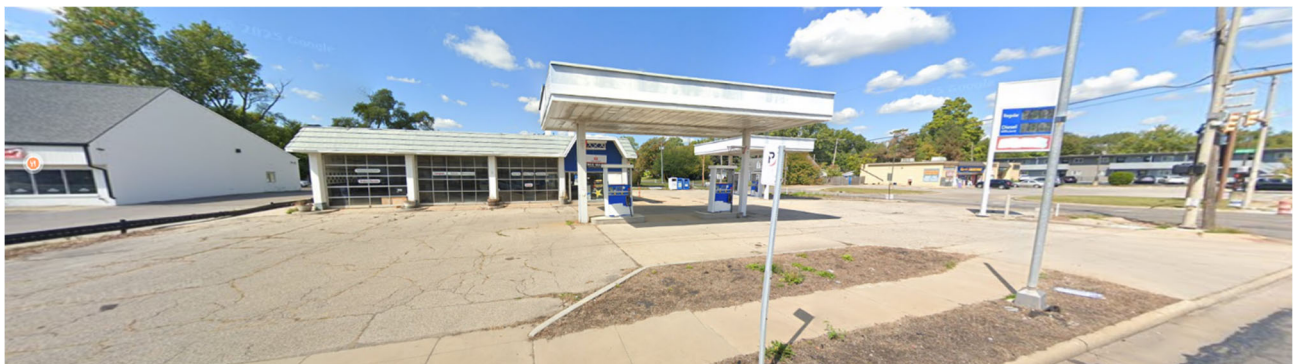
Google Street View (Sept 2025) image of the subject property from Reynolds Road.