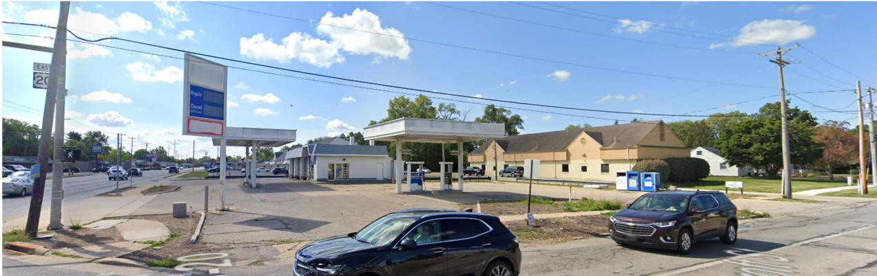
Google Street View (Sept 2025) image of the subject property from Bancroft Street.