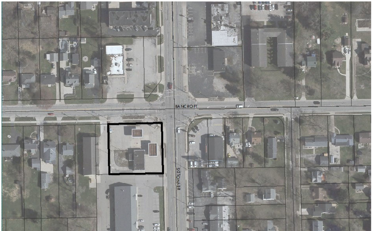
Aerial image of the subject property from Plan Commission GIS.

The gas pumps and canopies will remain unchanged other than new signage added. The existing service station will be converted into a convenience store by removing the overhead service bay doors and renovating both the Bancroft and Reynolds Road facing building facades. In addition, the overhead door on the rear of the building will be removed and metal siding installed. One (1) main building entrance will be provided facing Reynolds Road. Vehicular parking spaces are proposed both north of the building and along the western property line with an ADA accessible parking space at the southeast corner of the building. Staff is recommending approval of the Special Use Permit.