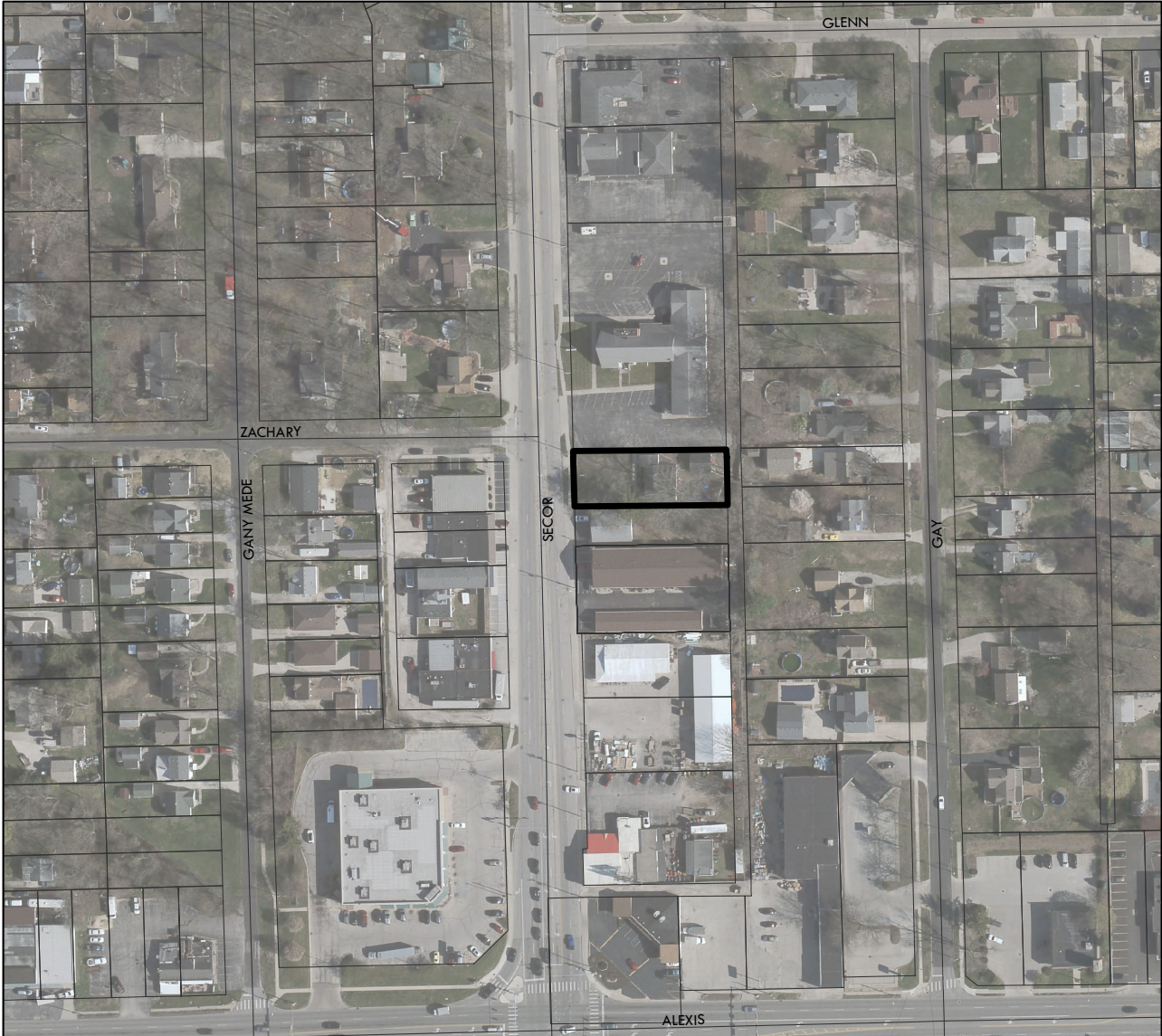
Aerial image of the subject property from Plan Commission GIS.