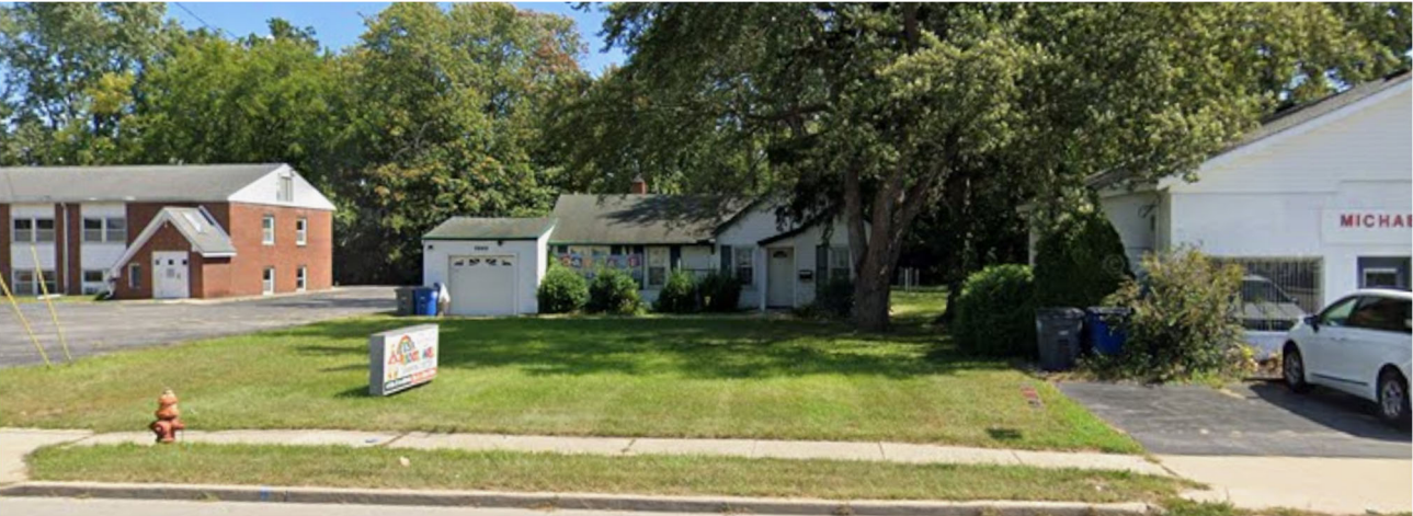
Google Street View (Sept 2025) image of the subject property from Secor Road.