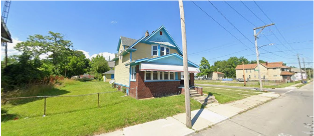
Street view image of the subject property. Applicant is requesting the Zone Change to allow group living.