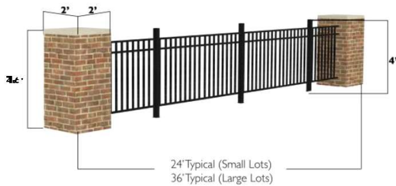
TYPICAL FENCING DESIGN