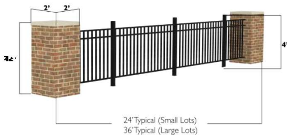
TYPICAL FENCING DESIGN