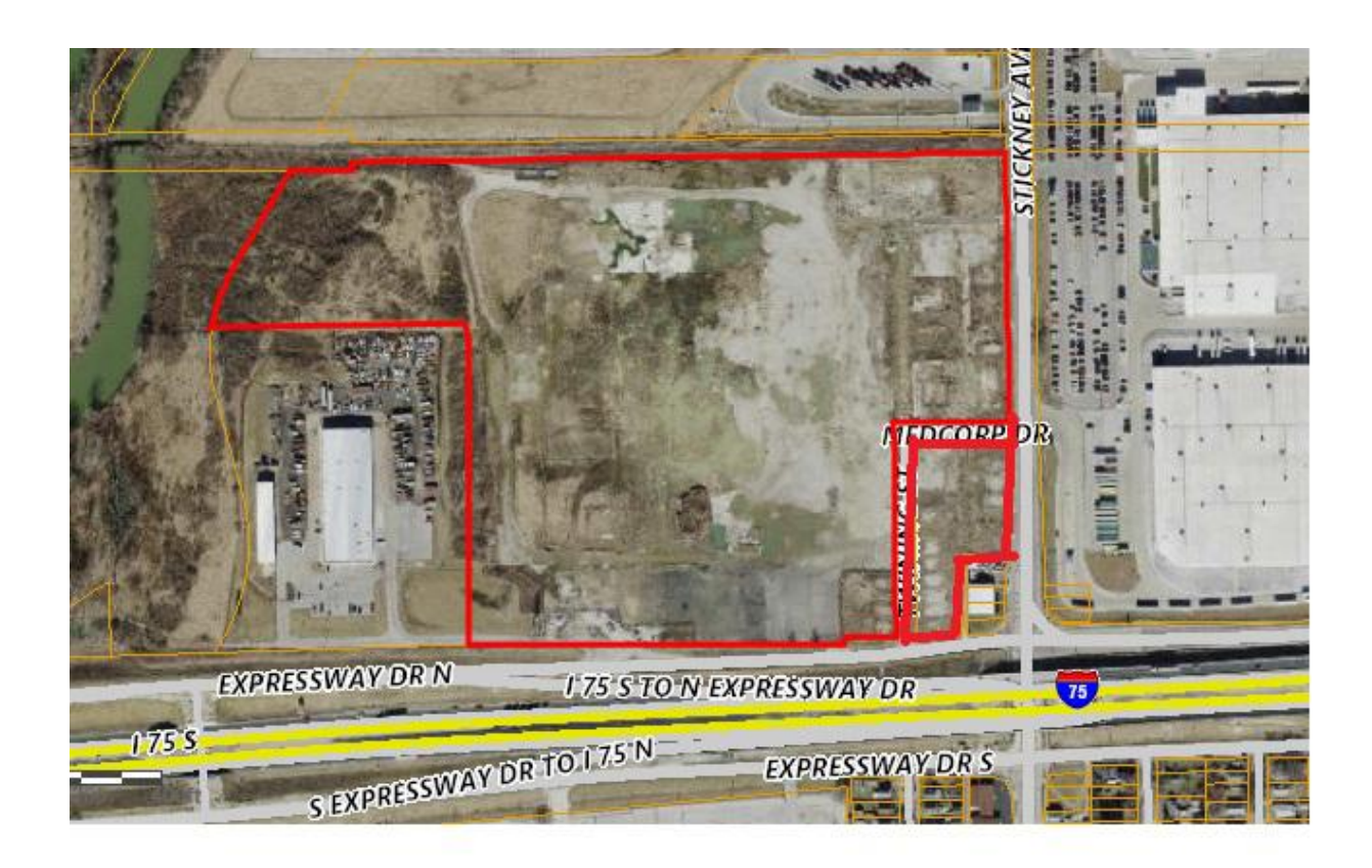
Legal Description of Parcels on following pages