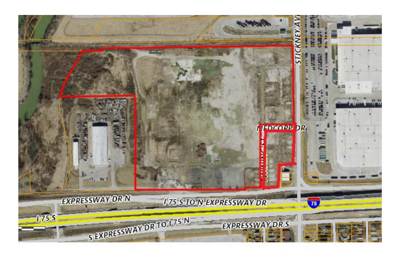
Legal Description of Parcels on following pages