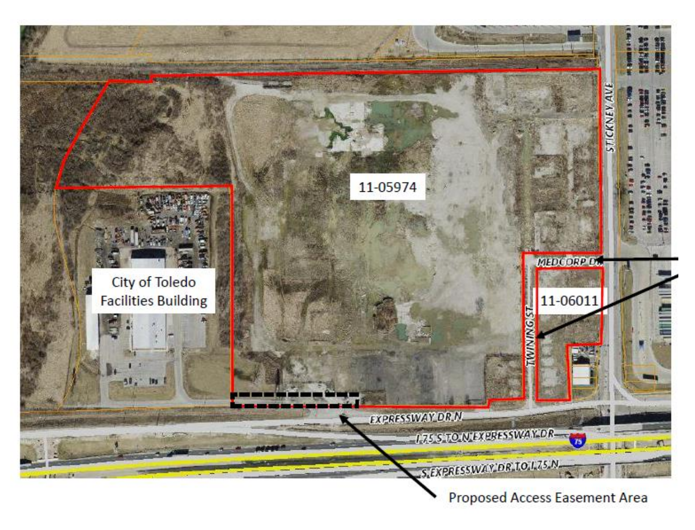
EXHIBIT J Access Easement Area