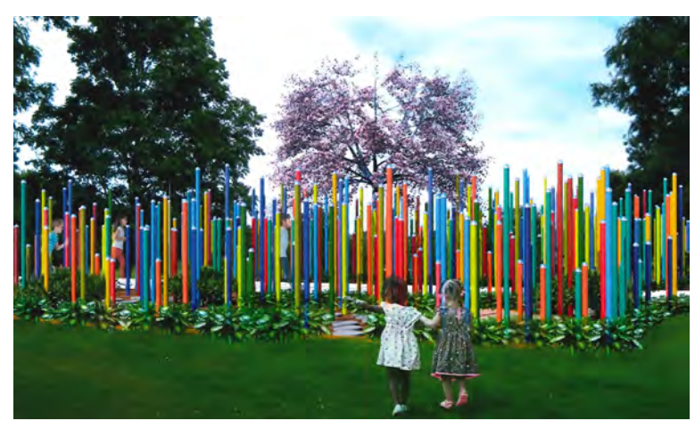
Artist's Rendering of Close. Closer, Closest

In March of 2019, a Request for Proposals was published for two new interactive public art projects for this years Momentum Festival, taking place