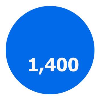
About what remains today Based on 2021 Toledo survey