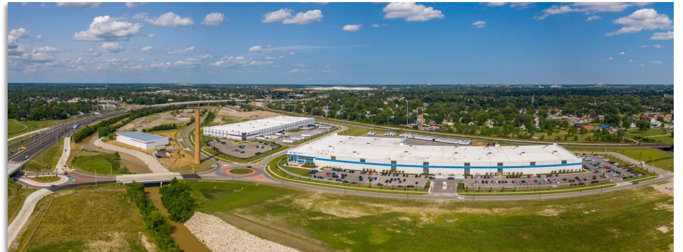
Overland Industrial Park