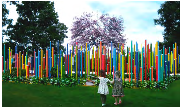
Close Park, Artist Rendering

Through an effort to further distribute Toledo's public works of art more evenly by district, Close Park in District 5 was identified as a site for a new public art project for 2019. Nestled in a densely populated West Toledo neighborhood and across the street from Blessed Sacrament School, this site has been identified as a perfect location for a new public art project. A request for qualifications was sent out on January 4, 2018, which resulted in responses from over 60 artists from all over the United States.