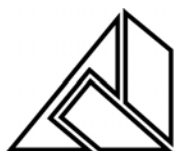
Exhibit A: Art in Public Places Program

THE ARTS COMMISSION INSPIRING A VIBRANT TOLEDO