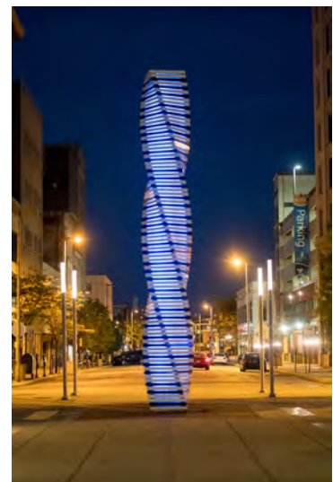
Cork Marcheschi's Art Tatum Celebration Column.

In 2018, the effort to photograph the Art in Public Places collection began and culminated in being featured in the Metzgers Printing Co. 2018 calendar. Photography of the remaining pieces will continue through 2018. The new photos will be used for a variety of promotional and educational purposes including The Arts Commission