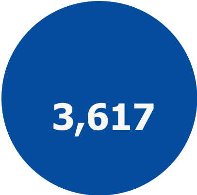
Demolitions completed 2012 - 2021