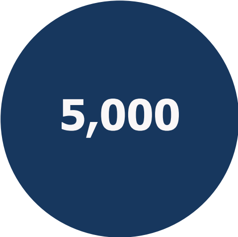
The original problem 2011