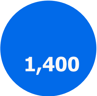
About what remains today Based on 2021 Toledo survey