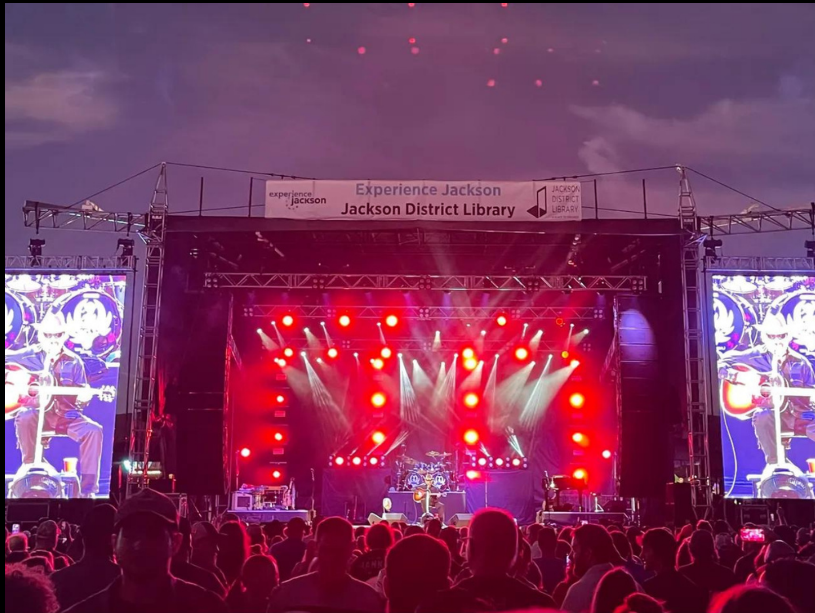
JACKSON COUNTY FAIR 2022