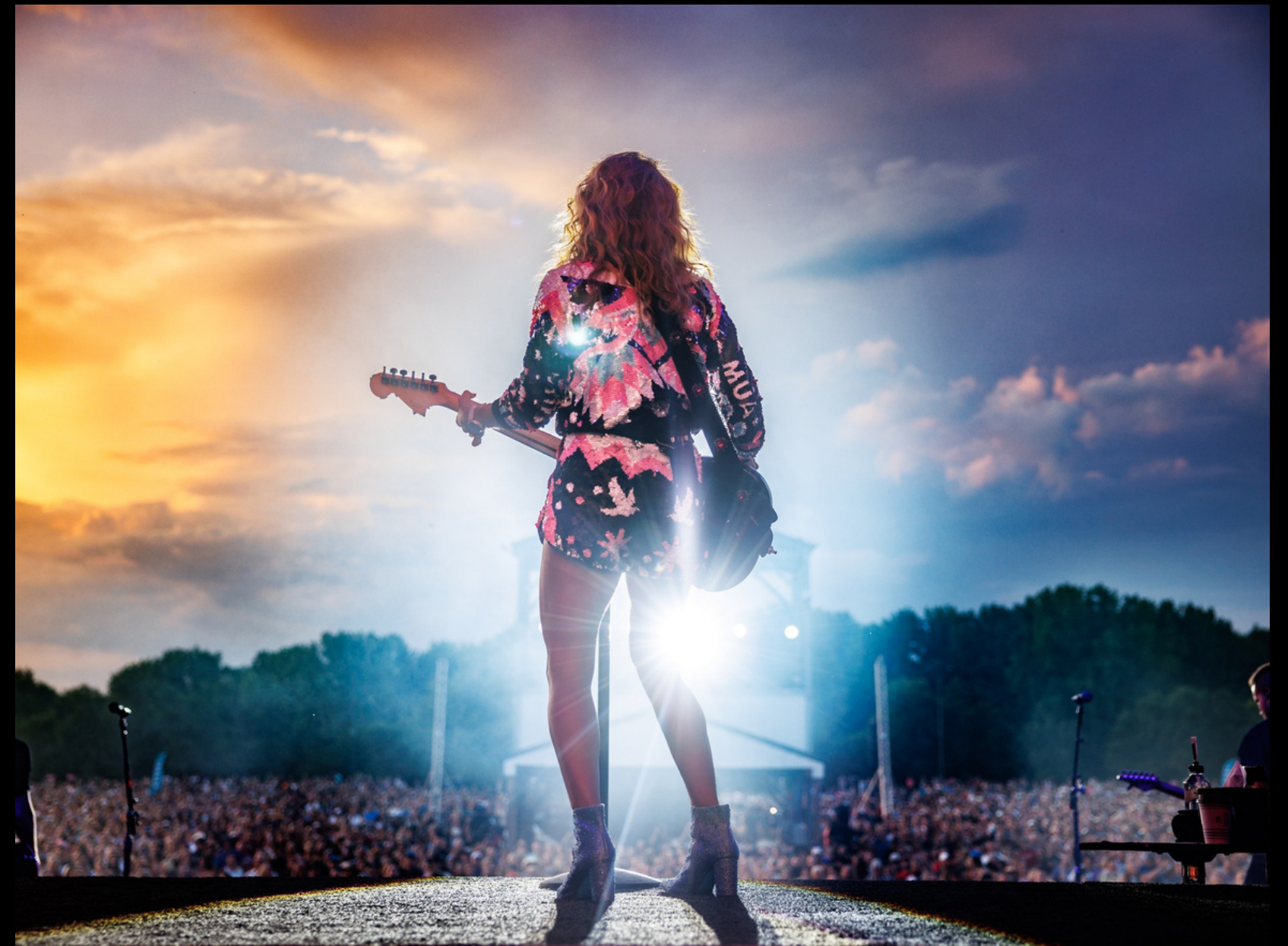
TREASURE ISLAND RESORT & CASINO 2023