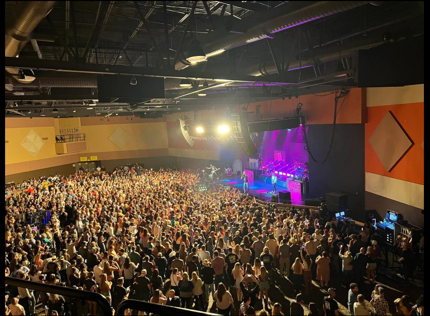
KEWADIN CASINOS - DREAM MAKERS THEATER 2023