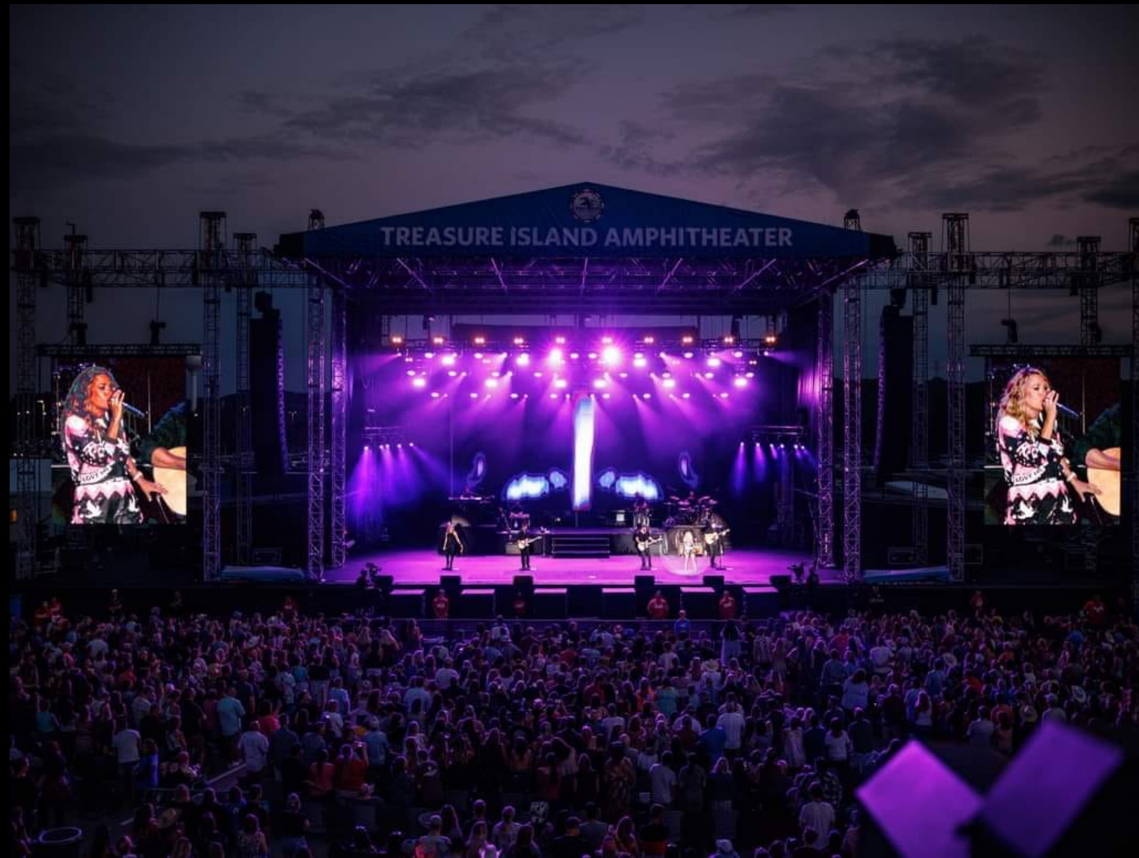
TREASURE ISLAND RESORT & CASINO 2023