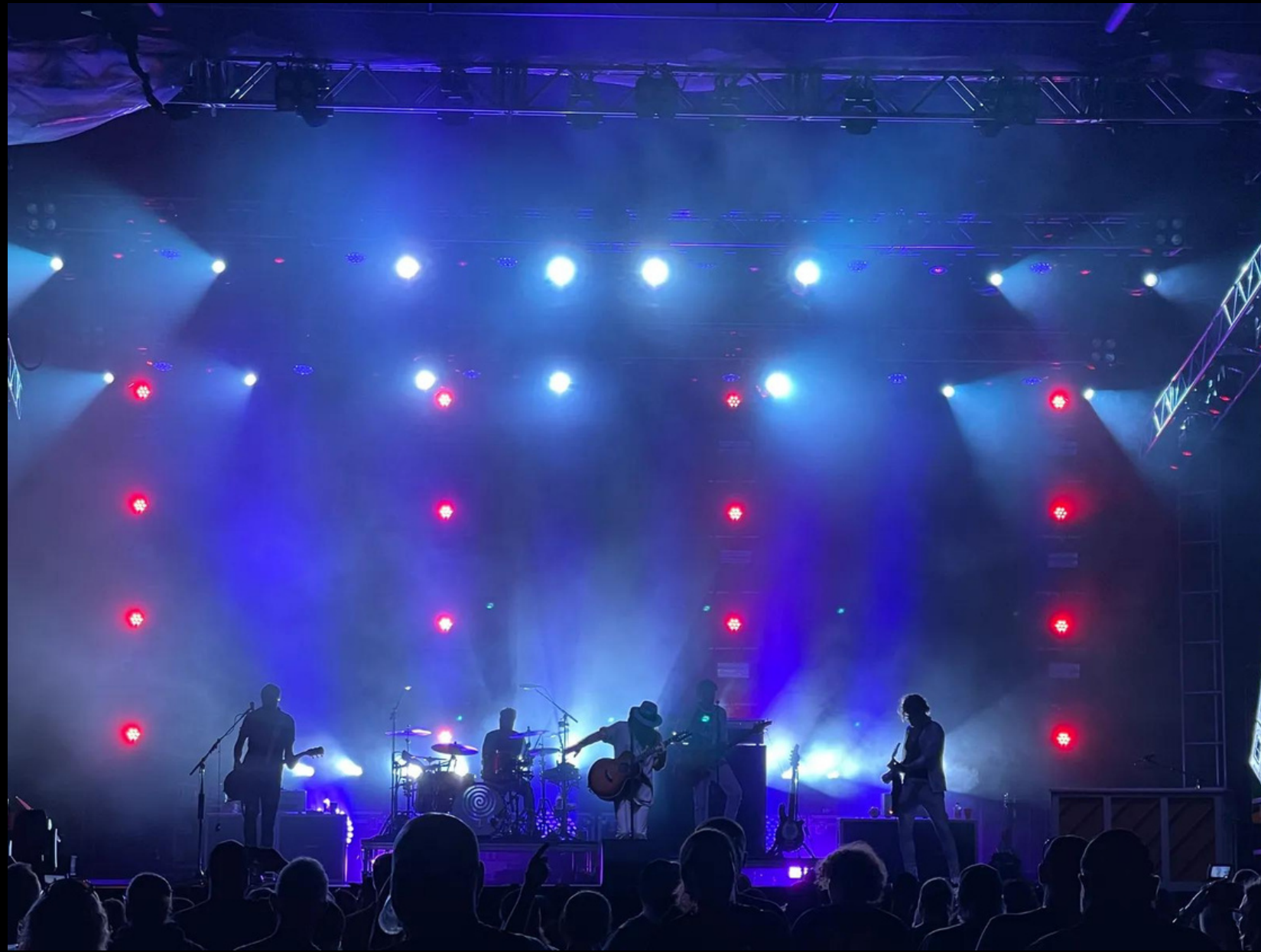
JACKSON COUNTY FAIR 2022