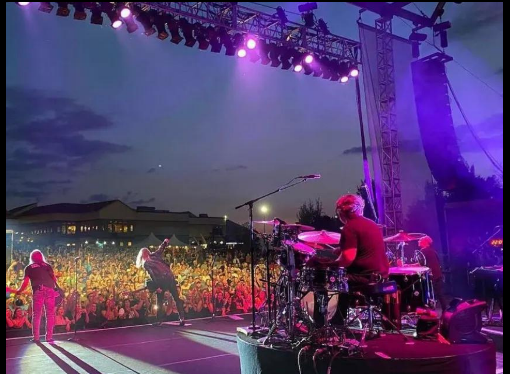
KEWADIN CASINOS OUTDOOR AMPHITHEATER 2022