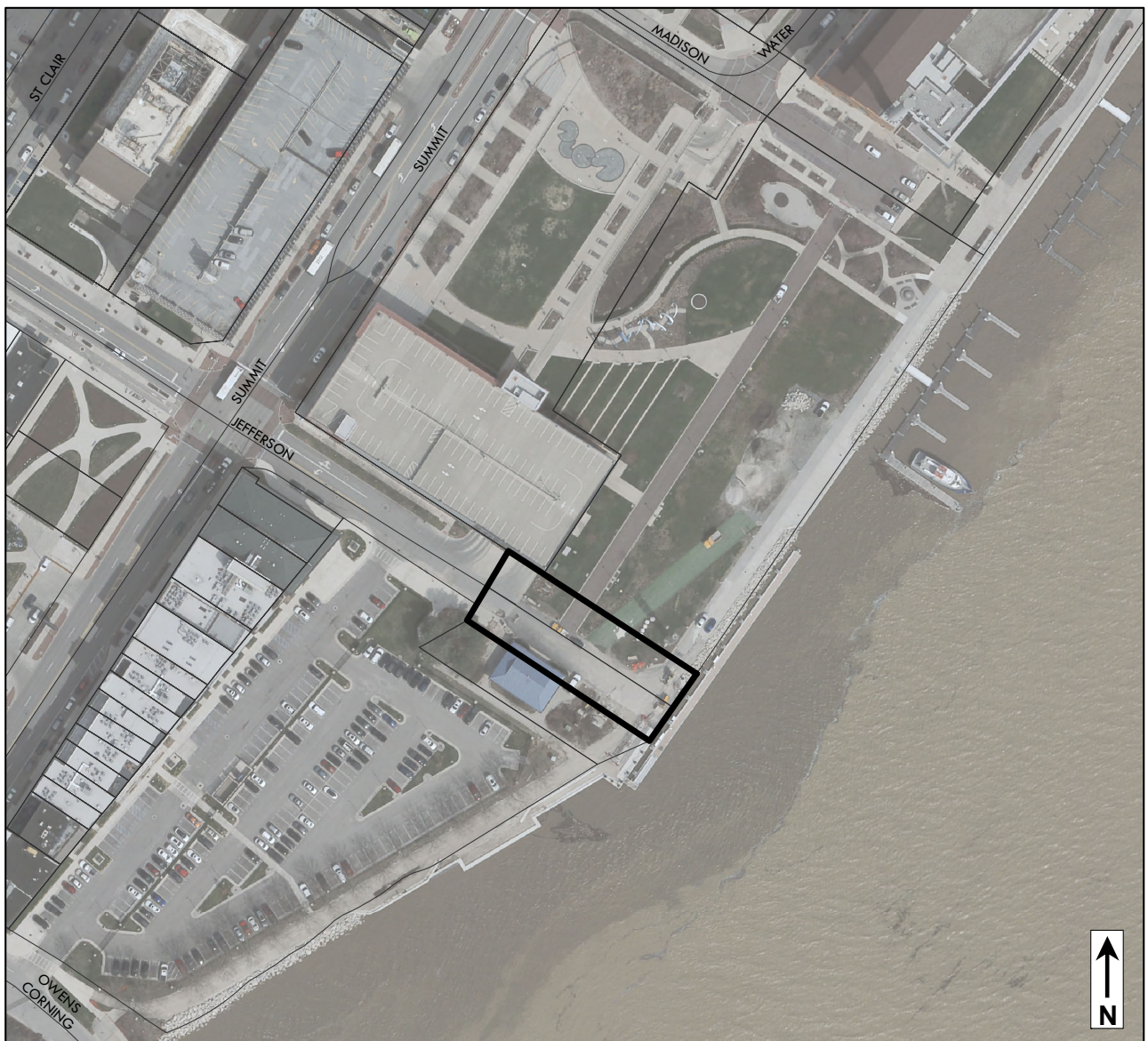
Aerial image of the subject property from Plan Commission GIS.

The purpose of the vacation is to correct the encroachment of the Jefferson Avenue comfort station building in the right-of-way so that the building is situated on one parcel. To achieve this, while preserving vehicular access to the Maumee River, the applicant is requesting to vacate the portion of Jefferson Avenue upon which the comfort station encroaches instead of the entire right-of-way. A survey and legal description is currently being completed for this specific area. The Fire Prevention Bureau is supportive of the revised vacation request provided adequate vehicular access remains. To ensure that adequate vehicular access is maintained, approval of the vacation request is conditioned on Fire Department approval of the revised vacation survey and legal description. Staff is recommending approval of the vacation request.