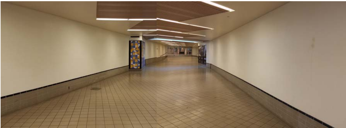
Vistula Garage Concourse

There are two City of Toledo owned sections of the concourses that are available for enhancement. The first is the concourse that connects the Vistula Parking Garage and One Seagate. This concourse is the main entrance to the tunnel system from the Vistula Garage and is used by visitors to One Seagate, The Renaissance Hotel, Imagination Station, The Collaborative Inc., The Toledo Design Collective and more. A few of these businesses have recently relocated to downtown as part of the reinvigoration of the Summit St corridor and surrounding downtown areas. The corridor is a “first impression” for many visitors to Toledo. The large, two-story sculpture, City Candy, is also located near the entrance of the tunnel system and acts as a landmark to the site.