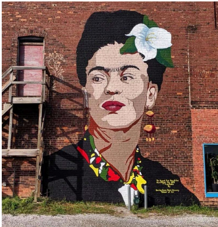
Frida Kahlo mural by BGSU School of Art.

The City of Toledo is home to a variety of murals, which have been created by artists from diverse cultural traditions and backgrounds. These murals improve the aesthetic impact of the city and play an important role in defining our cultural identity by creating a sense of biography for the residents. The Arts Commission encourages this activity and seeks to further promote mural making in the City of Toledo through facilitating Toledo's Mural Ordinance.