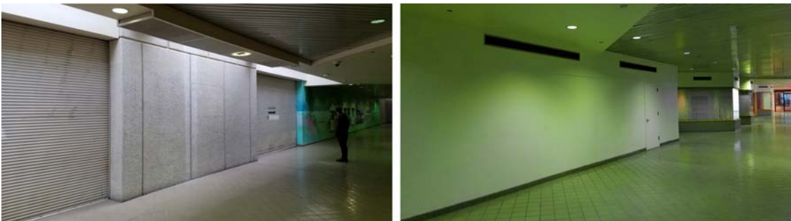
Concourse leading to Imagination Station

The second potential site is the corridor below the Renaissance Hotel that leads to the lower entrance to the Imagination Station. Many families that park in the Vistula Parking Garage to visit the Imagination Station traverse this corridor. With the new IMAX Theater under construction, this traffic is sure to increase.