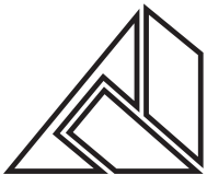
Exhibit A: Art in Public Places Program