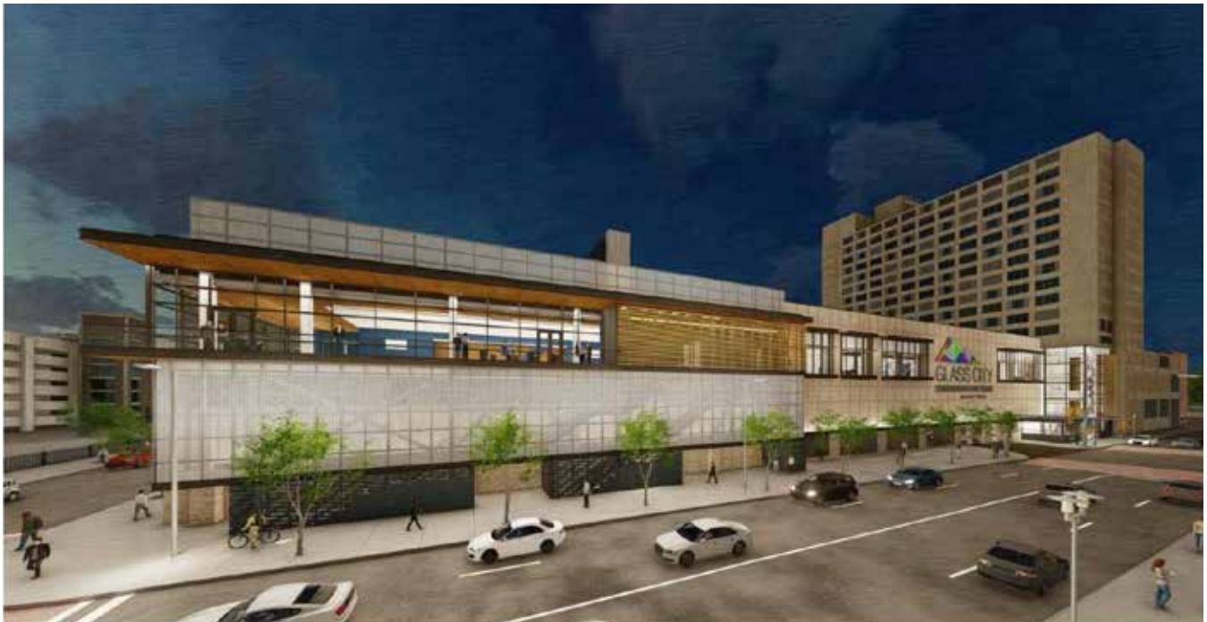
Rendering by The Collaborative Architects