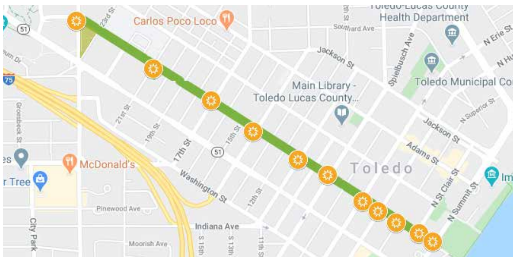
Signal box locations along Jefferson

Launched in March of 2021, phase one for the project is Jefferson Ave. from the Old West End to the riverfront. Jefferson is a major corridor that connects The Old West End, including the Toledo Museum of Art to the core of downtown Toledo. The street is undergoing a reconstruction starting in spring of 2021, which will include a dedicated bike lane. This project is a great opportunity to commission work from local artists of many different disciplines as well as enhance the pedestrian and bicycle experience along the corridor.