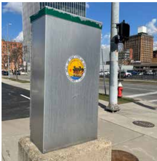
Regular signal box