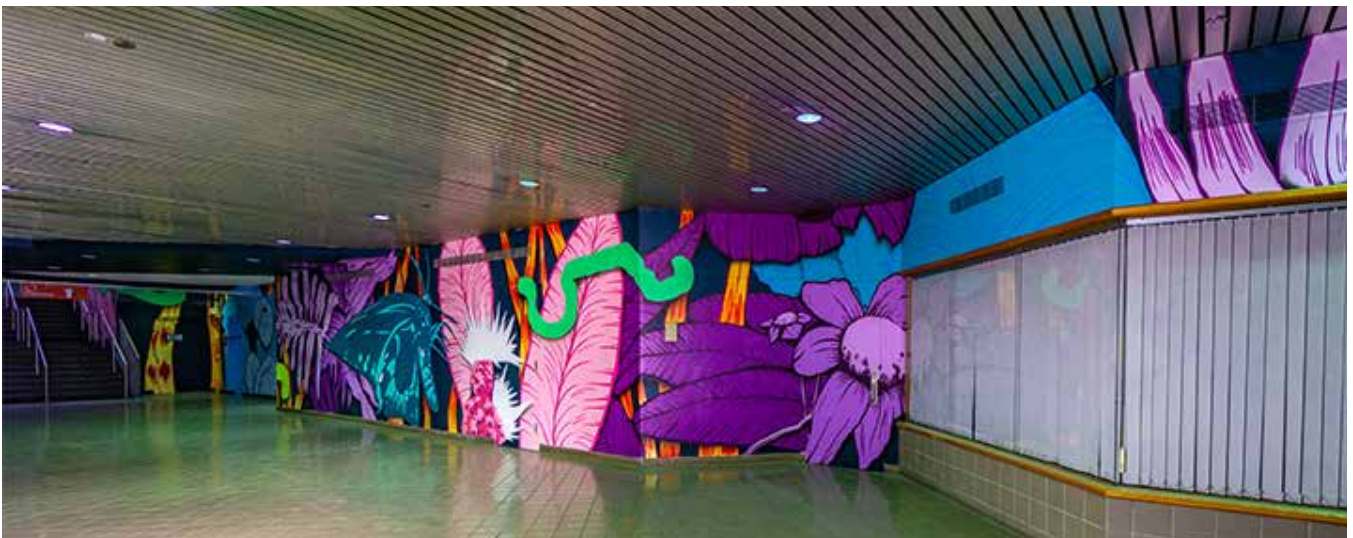
One The Wings by Ken Dushane.

Located in the concourse below The Renaissance Hotel that leads to the lower entrance of Imagination Station, Ken Dushane's "On the Wings" mural is an immersive scene full of images large flora and butterflies that are native to the area to create a sense of being enveloped in the natural world.