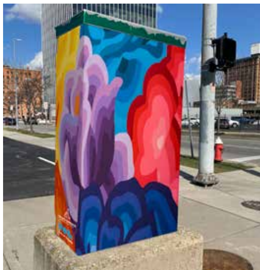
Artist designed signal box