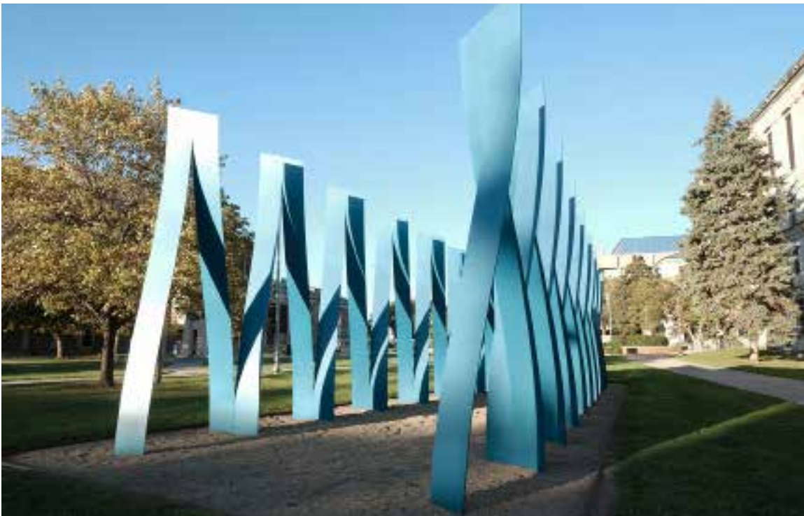
Perspective Arcade.

Perspective Arcade (Athena Tacha), the large painted steel sculpture located in Civic Center Mall is scheduled for repainting in 2021. The field of stone that the sculpture sits in is going to be replaced as well.