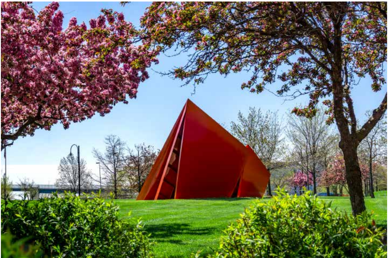
Major Ritual.

There is a large amount of strategic planning underway for projects in 2021 and 2022. These projects include collaborative efforts with The Arts Commission's Creative Placemaking and Young Artists at Work programs. Some of these efforts include analysis of City of Toledo Parks and arts related infrastructure opportunities and establishing connectivity along strategic corridors through art and infrastructure. Also underway, is the creation of a mural guide and other resources for muralists and building owners as well as a data base of permitted murals in the City. These efforts are in line with The Arts Commission's core goals of supporting local artists, enhancing the built environment, providing safe and self-guided cultural experiences; and ensuring that arts and culture is inclusive, diverse, equitable and accessible for all.