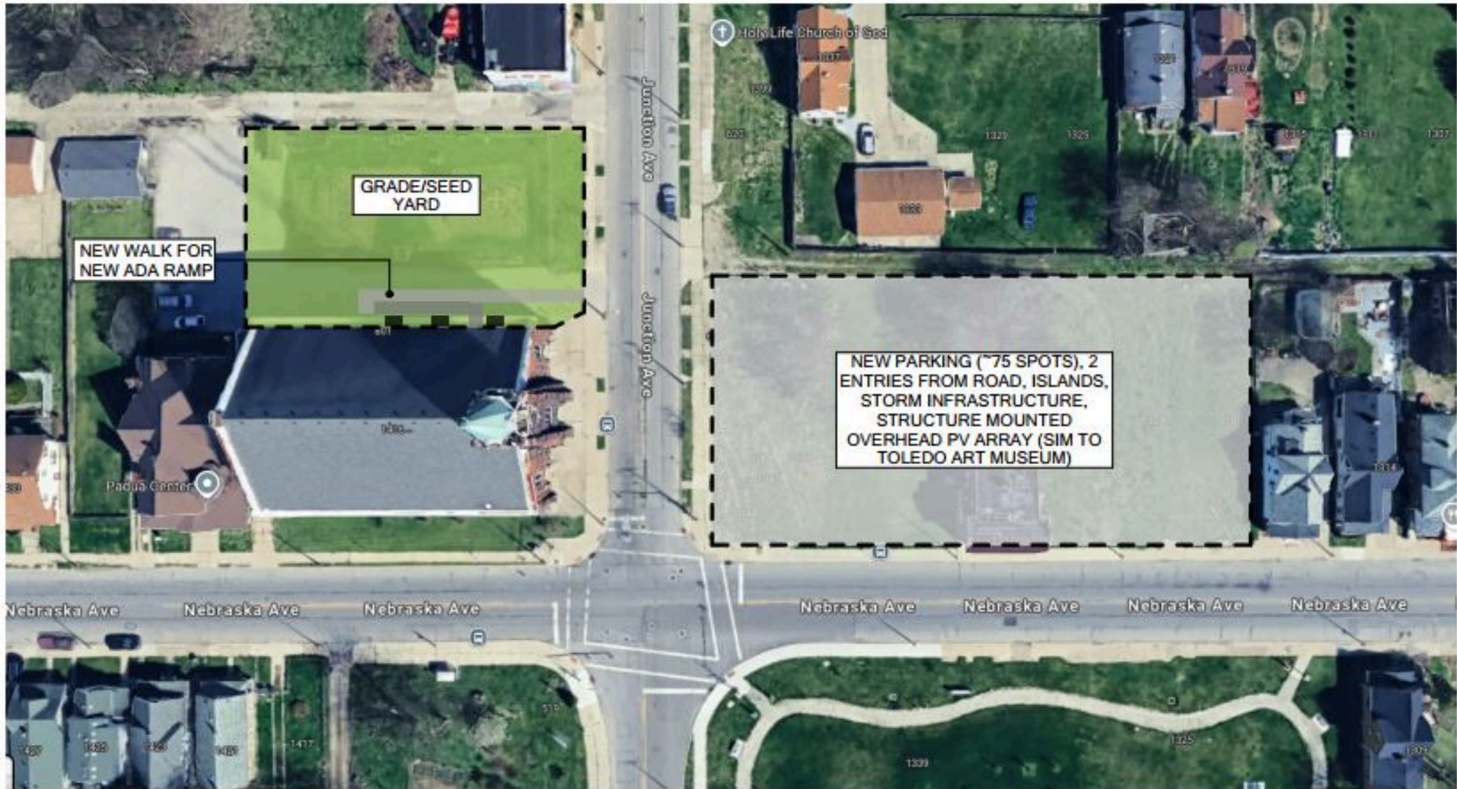
SITE PLAN - NEW